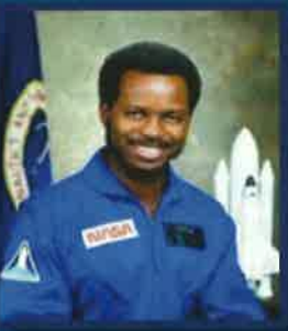
Ronald E. McNair, PhD

10/21/50 - 01/28/86 Scientist, Scholar, Musician, Athlete, Parent and Astronaut