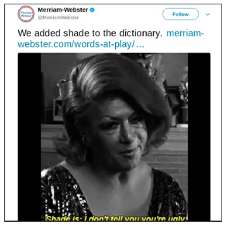
Figure 1. Merriam-Webster tweet including "Paris is Burning" scene

In February 2017, the Merriam-Webster dictionary officially acknowledged the phrase "throw shade" as part of the lexicon of American English. The event marked the term as having become mainstream. While many American English speakers may have dismissed this as slang popularized for mass appeal; it can take on greater significance when an intersectional lens is applied to the phenomenon. The cultures, mechanisms and instances of its usage create a more complex picture. Specifically, the term "throw shade" (an extended usage of the slang phrase "shade") means "to express contempt or disrespect for someone publicly especially by subtle or indirect insults or criticisms" (Shade). The manner in which it was announced, by a post on Twitter, situates the origins of the phrase within a larger historical context.